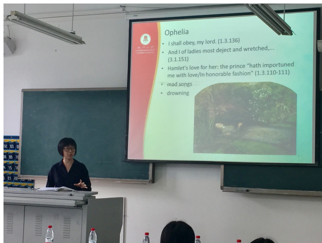
Windy on 'Women characters in Film Adaptations of Hamlet'