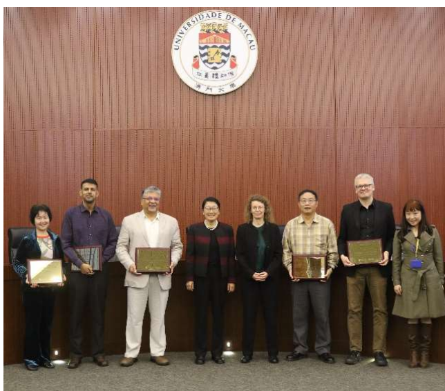
FAH leadership & awardees at the Academic Council