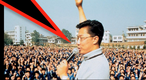
Frank & Moon Zappa Valley Girl